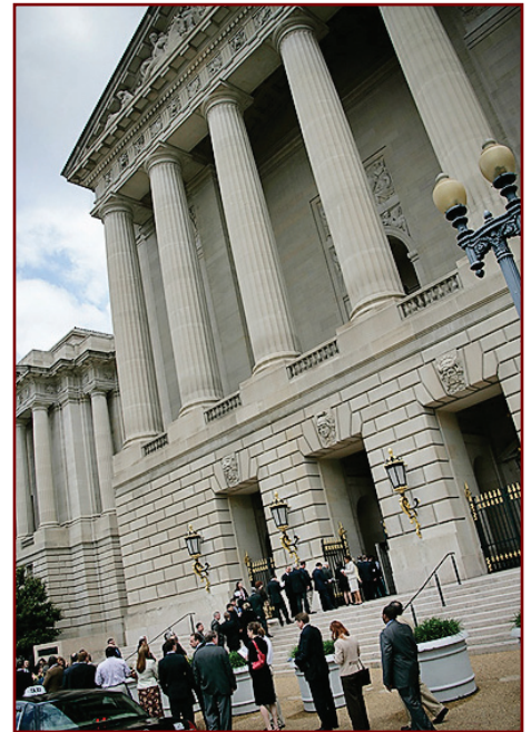
Outside the Andrew W. Mellon Auditorium

Andrew W. Mellon Auditorium Washington, D.C. Monday, June 20, 2011